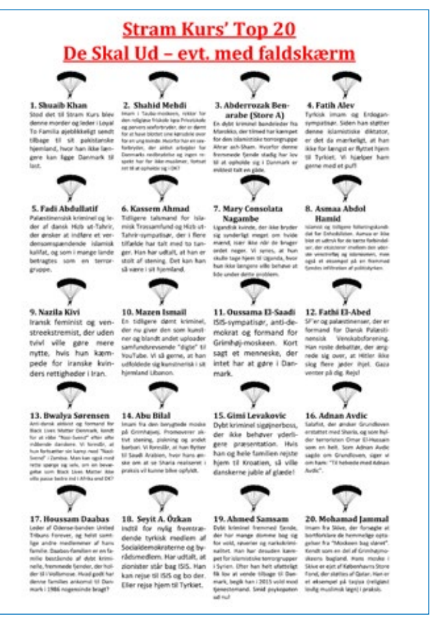
Figure 5: List of 20 public figures Rasmus Paludan promises to expel if he wins the local elections. ^{82}

She also made headlines both for lying about about education, statistics in relation to welfare and about a kindergarten she claimed did not allow pork to be served because of Muslims dietary preferences.83 She used the satirical cartoons of the Prophet Muhammed from 2005 as a wallpaper on her phone and published it on social media.84 It caused the former chief of security services (PET) to call her both childish and a security threat.85 She also made headlines for the