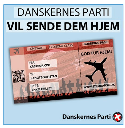
Figure 1: the Danes party distributed the fake tickets above in majority Muslim neighbourhoods, the tickets read; "Have a good journey home", "From: Copenhagen, To:Far-away-stan" 15

Thus, bias against Muslims intensified with the Social Democratic Party shifting to a populist rhetoric joining the Danish Peoples party in their anti-Muslim efforts, while civil society presented new and innovative ways to counter the hate.